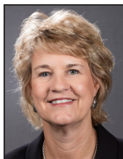
Lisa Bluder Head Coach