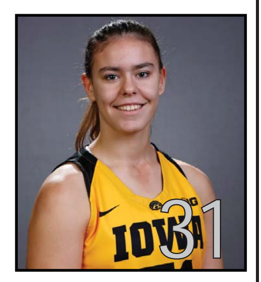
Forward • 6-3 • Freshman Ourense, Spain les Otero Pedrayo

Made her Hawkeye debut in Iowa's seasonopening win over Quinnipiac on Nov. 10.