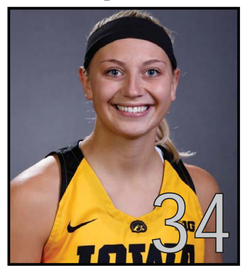
Forward • 6-1 • RS Junior Brodhead, Wis. Brodhead

Scored four points, pulled down three rebounds, and dished out two assists in Iowa's win over Western Kentucky on Nov. 11.