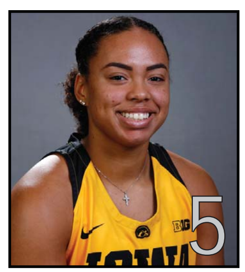
Guard • 5-5 • RS-Freshman Goodrich, Mich. Goodrich