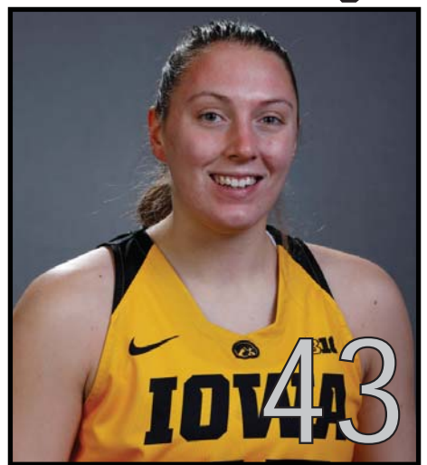
Forward • 6-1 • Sophomore Cedar Rapids, Iowa

Netted four points and pulled down five boards in Iowa's season-opening win over Quinnipiac on Nov. 10.