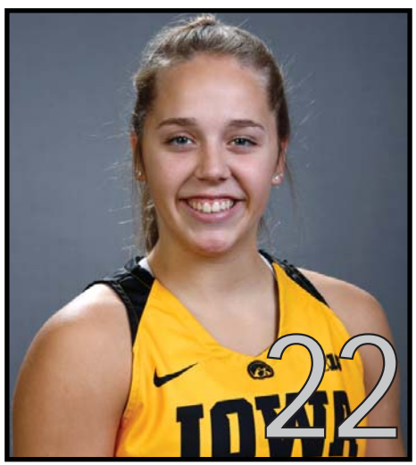
Guard • 5-9 • Sophomore LaGrange Park, Ill.