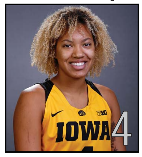
Center • 6-3 • Senior Minneapolis Washburn

Scored eight points and registered eight rebounds in Iowa's season-opener against Quinnipiac.