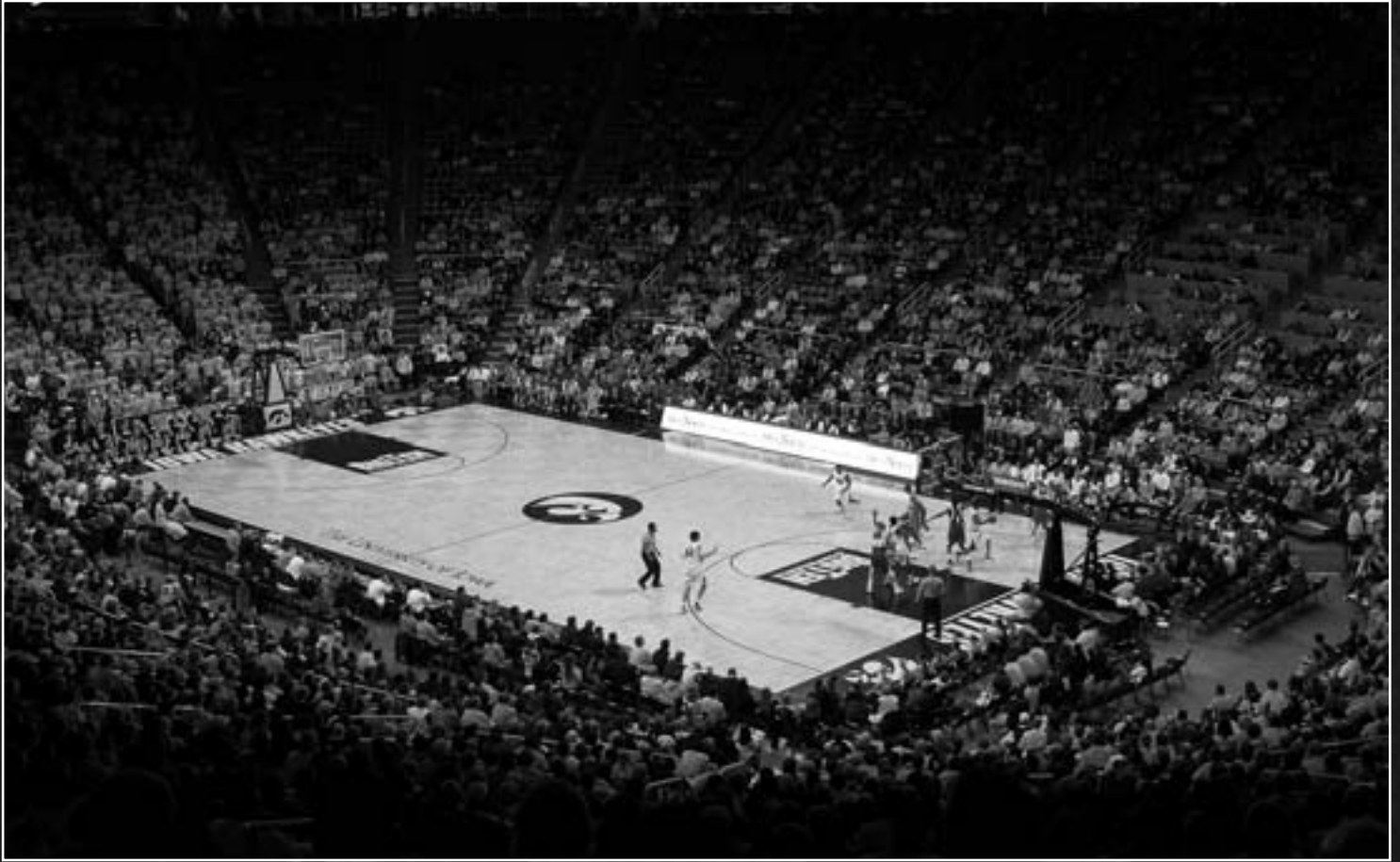
Carver-Hawkeye Arena has served as the home of Iowa basketball since 1983. The Hawkeyes are 41-10 in home games over the past three seasons.