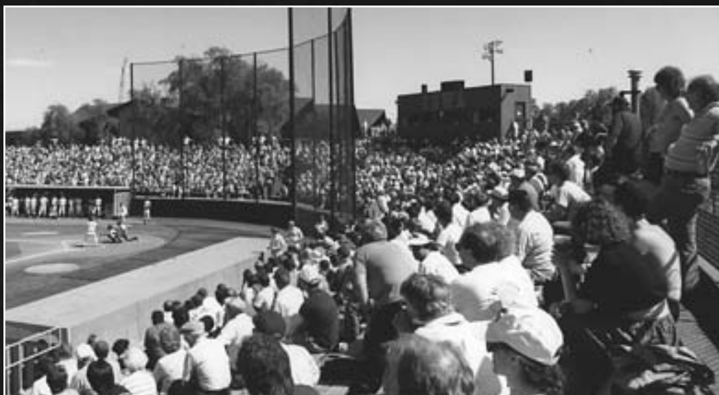
The UI's Duane Banks Baseball Stadium ranks as one of the top baseball facilities in the Big Ten Conference and the Midwest. Lights were recently added to the stadium to allow for night games.