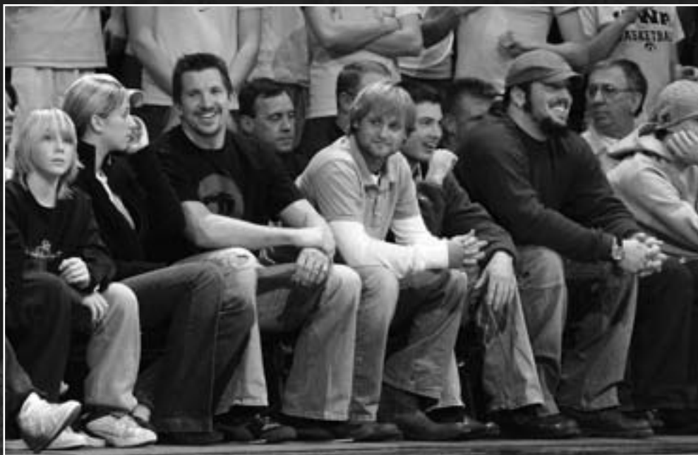
Former Hawkeye football all-Americans, including TE Dallas Clark (left), PK Nate Kaeding (center) and OL Robert Gallery (right) returned to Carver-Hawkeye Arena to cheer on the Hawkeyes.

In the 1990's Iowa basketball teams won at least 20 games in seven different seasons, including five straight seasons from 1995-99.