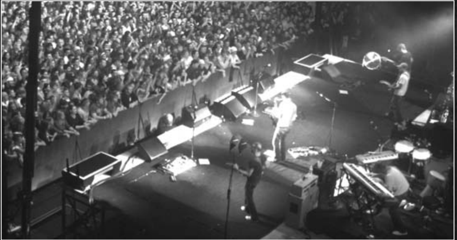
With a seating capacity of over 15,000, Iowa's Carver-Hawkeye Arena hosts some of the top concerts in the Midwest.

"Iowa City is unlike any other place in the state, both because of its regional beauty and because of its independent, serendipitous spirit."