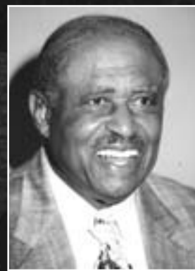
EDDIE ROBINSON Former Football Coach Grambling State University

When a student-athlete considers his future, he should consider prospects beyond basketball. He should consider where he wants to be five, ten, fifteen years from today, and the best course of action for getting there. Also, he should decide early on to commit to excellence in every challenge undertaken.