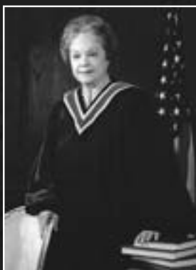
JUANITA KIDD STOUT First African-American woman Elected to a state Supreme Court