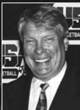
DON NELSON Head Coach, Golden State Warriors