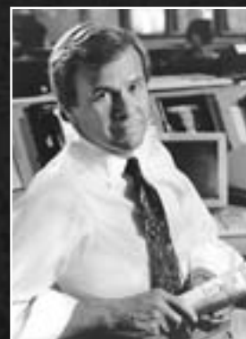
TOM BROKAW Former Anchorman, NBC News