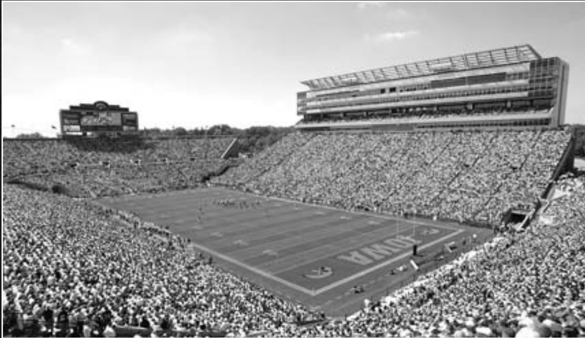
Kinnick Stadium, the home of Iowa football, has been sold out for every home game since the 2003 season.