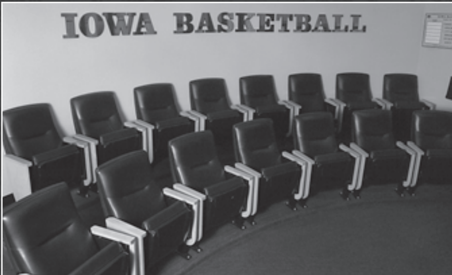
(Above) The Iowa locker room features a team meeting area, where the Hawkeyes can go over scouting reports and scout opponents for upcoming games.

UNIVERSITY OF IOWA EQUIPMENT AND APPAREL PROVIDED BY NIKE.