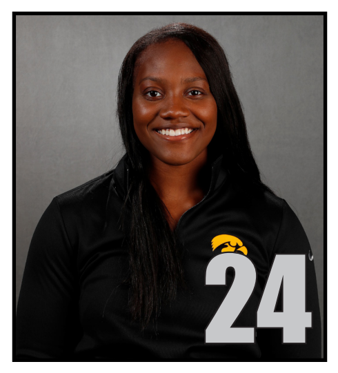
Guard • 5-8 • Sophomore Evansville, Ind. Central

Registered a career-high three rebounds in Iowa's season-opening win over Oral Roberts on Nov. 9.