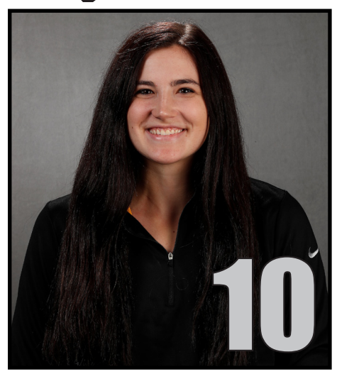
Center • 6-3 • Senior Port Wing, Wis. South Shore