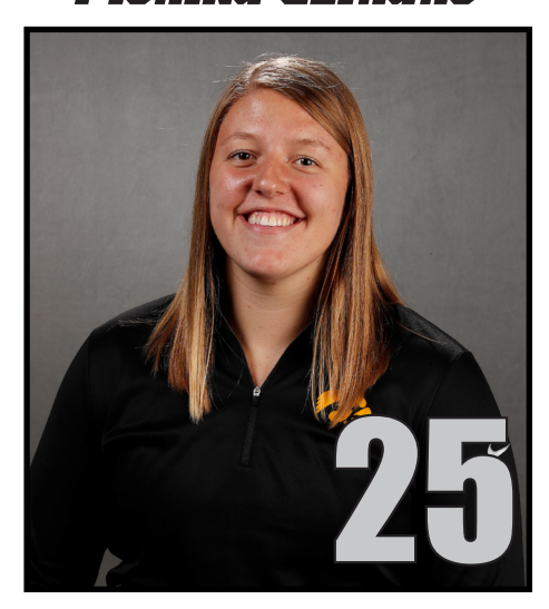
Forward • 6-3 • Freshman Watertown, Minn. Watertown-Mayer