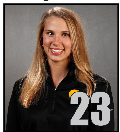
Forward • 6-1 • Freshman Iowa City, Iowa West