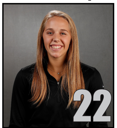
Guard • 5-9 • Junior LaGrange Park, III. Benet Academy