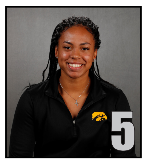
Guard • 5-5 • RS-Sophomore Goodrich, Mich. Goodrich