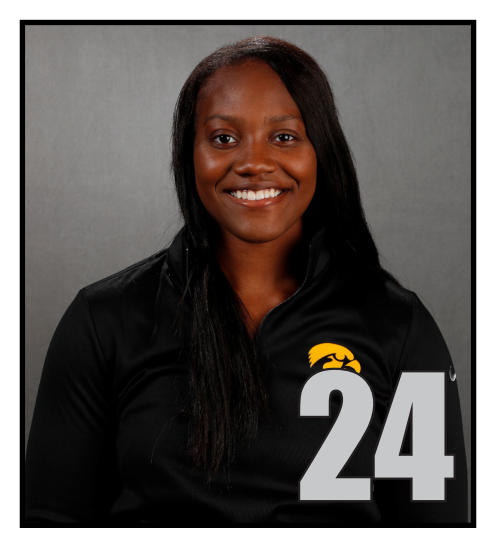
Guard • 5-8 • Sophomore Evansville. Ind. Central