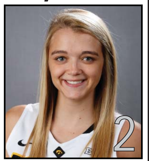
Guard • 6-0 • Senior Iowa City, Iowa West