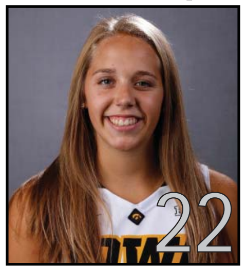
Guard • 5-9 • Freshman LaGrange Park, III. Benet Academy