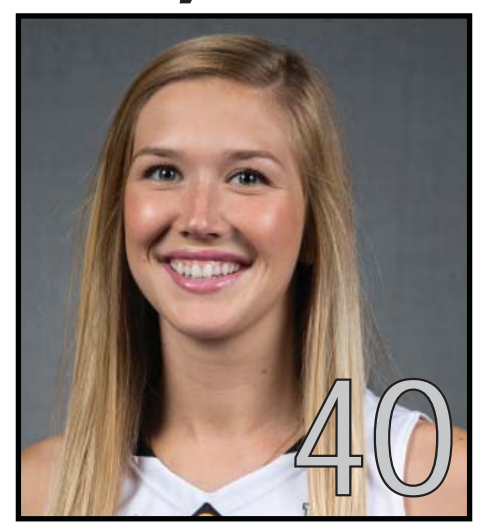
Forward • 6-2 • Senior Davenport, Iowa Assumption

2016-17... Has appeared in 11 contests this season... pulled down two rebounds in lowa's win over Kent State... scored four points and recorded a steal in lowa's win over UNI.