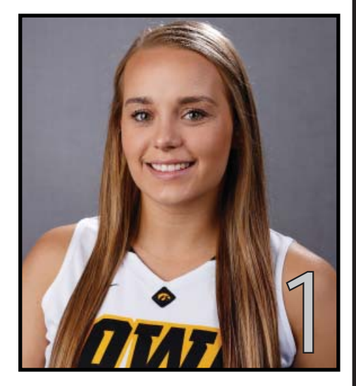
Guard • 5-10 • Senior Lincoln, Neb. Southeast

2016-17... Has appeared in all 31 contests this season with three starts... netted eight points in Iowa's WNIT First Round win over Missouri State on March 16... hit back-to-back 3-pointers to extend lowa's fourth quarter lead and seal a win over Wisconsin on Feb. 26... netted eight points, pulled down four rebounds, and dished out three assists in the contest... tied a careerhigh with seven rebounds at Indiana on Feb. 22... registered eight points, five rebounds, and three assists in Iowa's win over Northwestern on Feb. 16... netted seven points and pulled down three boards at No. 13 Ohio State... scored six points and dished out two assists in lowa's win over Kent State... recorded five points, three assists and three steals in lowa's win over UNI... scored a team-high 17 on 5-10 shooting from three-point range in Iowa's win over UMass... registered two points, two assists, and two steals in Iowa's win at North Dakota... went 2-for-4 from 3-point range in lowa's win love Hampton on Nov. 13.