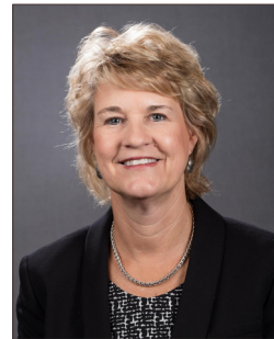
Lisa Bluder Head Coach