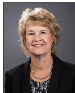
Lisa Bluder Head Coach