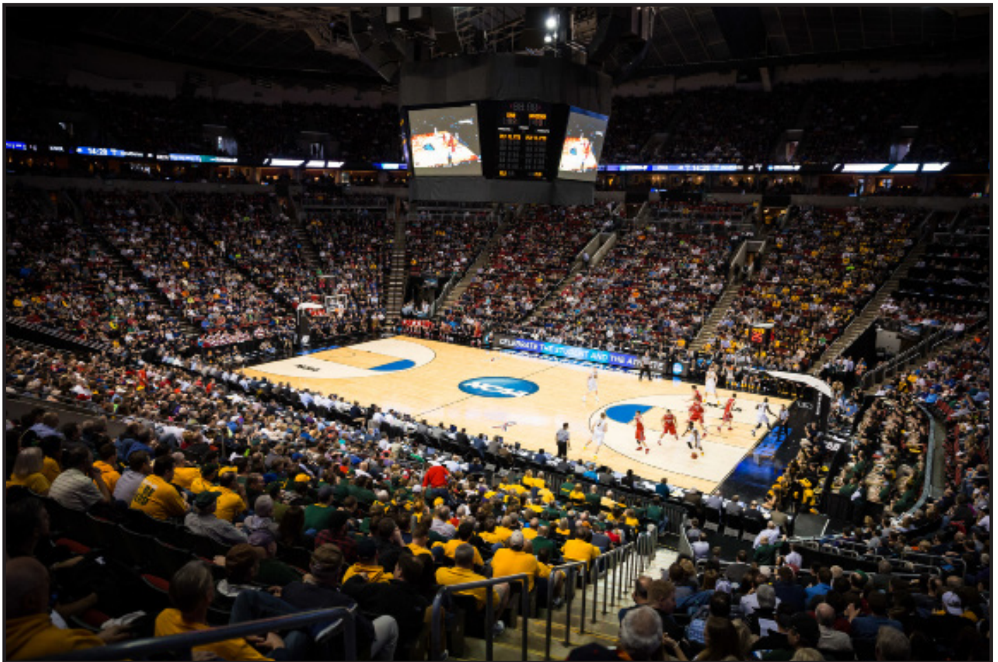
Iowa posted the largest margin of victory (31 points) in a 7/10 matchup in NCAA Tournament history with an 83-52 win over Davidson in the Round of 64 on March 20, 2015, in Seattle, Washington.