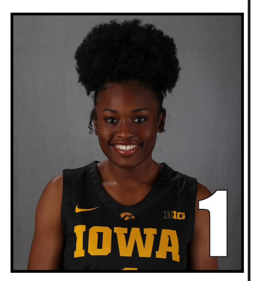
Guard • 5-10 • Senior Carmel, Ind. Carmel