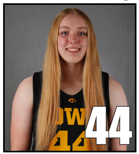
Forward/Center • 6-4 • Freshman Aurora, Colo. Grandview