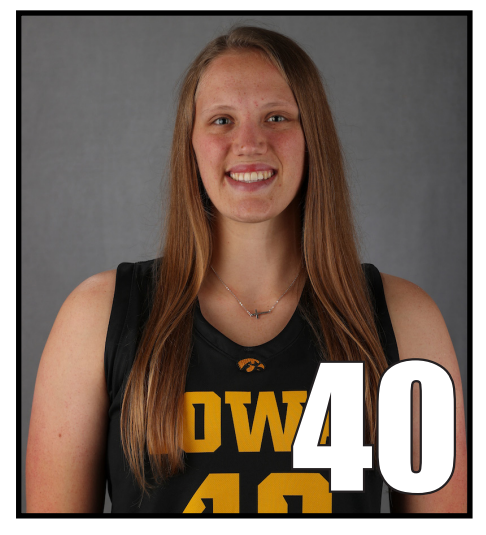
Center • 6-3 • Sophomore Lime Springs, Iowa Crestwood