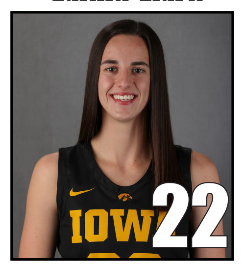
Guard • 6-0 • Sophomore West Des Moines, Iowa Dowling Catholic