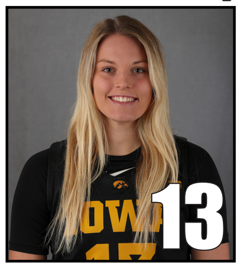
Forward • 6-0 • Sophomore Montezuma, Iowa Montezuma