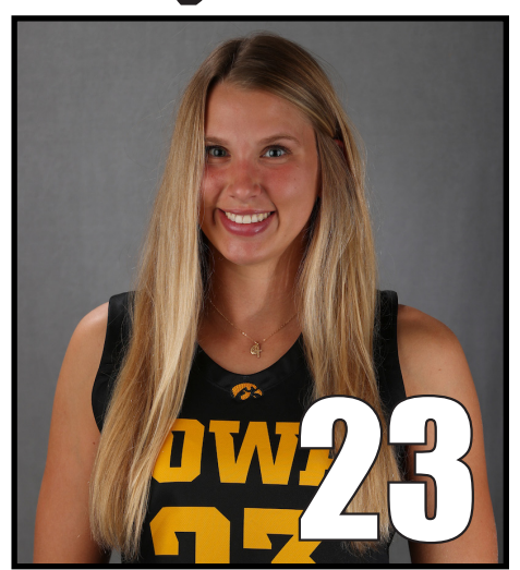
Forward • 6-1 • Senior Iowa City, Iowa West