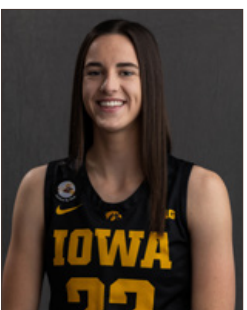
#22 Caitlin Clark Junior Guard