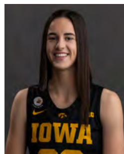
#22 Caitlin Clark Junior Guard