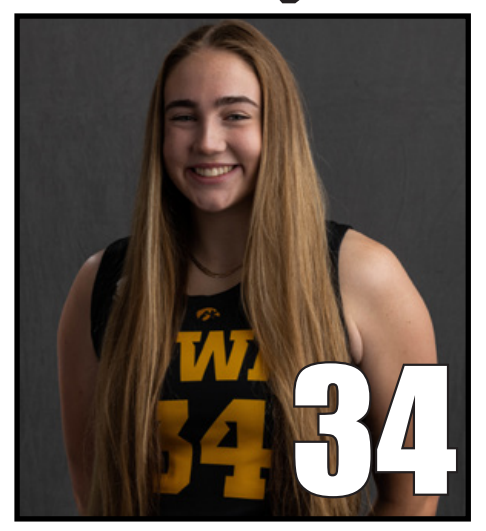
Forward • 6-2 • Sophomore Hudsonville, Mich.