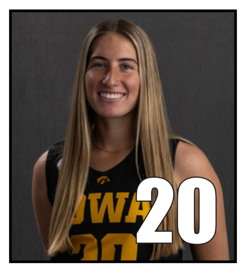
Guard • 6-0 • RS-Senior Edwardsville, Ill. Edwardsville