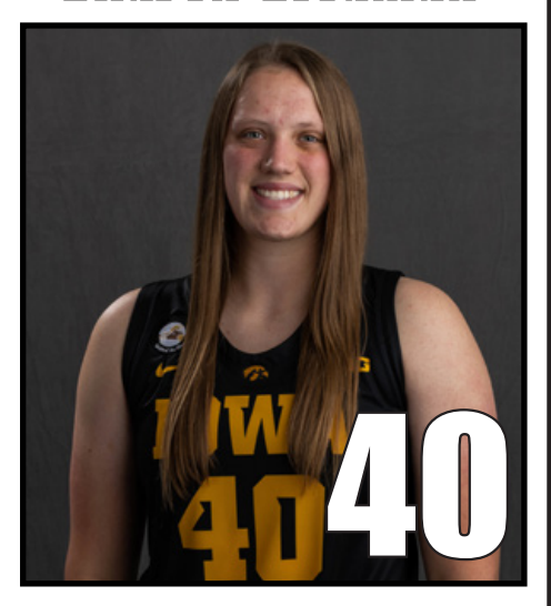
Center • 6-3 • Junior Lime Springs, Iowa Crestwood