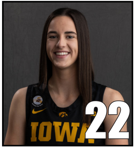
Guard • 6-0 • Junior West Des Moines, Iowa Dowling Catholic