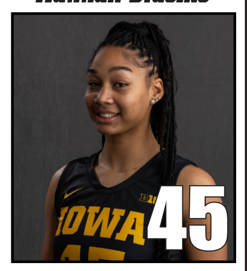
Forward • 6-2 • Freshman Cedar Rapids, Iowa. Washington