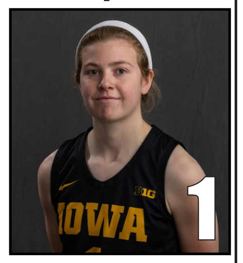
Guard • 5-7 • Senior Midland, Mich. H.H. Dow/Central Michigan