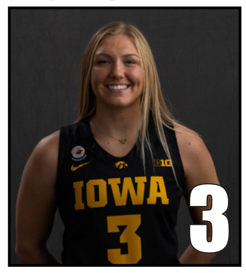
Guard • 5-11 • Sophomore Chicago, Ill. Marist