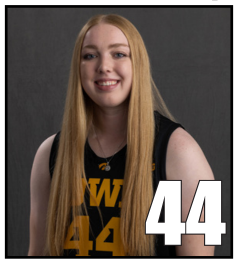
Forward/Center • 6-4 • Sophomore Aurora, Colo.