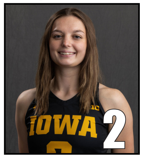
Guard • 5-9 • Freshman Fremont, Neb.