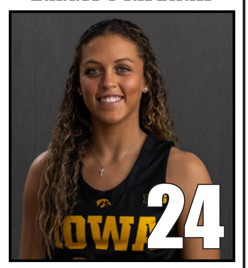
Guard • 5-10 • Senior Cincinnati, Ohio Mount Notre Dame