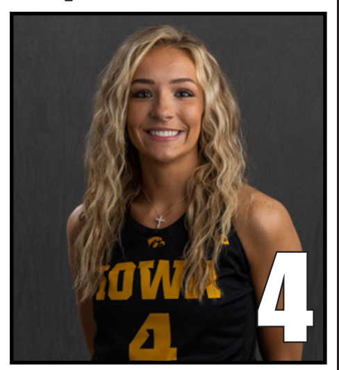
Guard • 6-0 • Junior Sycamore, Ill. Sycamore / Iowa State