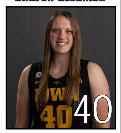
Center • 6-3 • Junior Lime Springs, Iowa Crestwood

Made debut against Southern U after being out 2021-22 season due to injury.