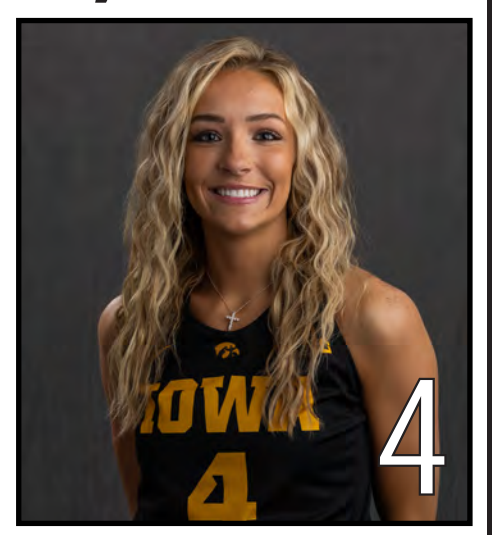
Guard • 6-0 • Junior Sycamore, Ill. Sycamore / Iowa State