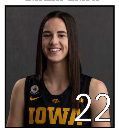
Guard • 6-0 • Junior West Des Moines, Iowa Dowling Catholic

*For full career highlights, see player page 6, 7. *