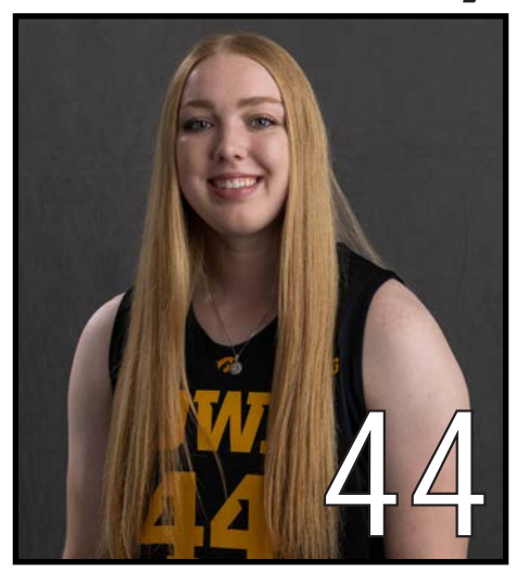
Forward/Center • 6-4 • Sophomore Aurora, Colo. Grandview