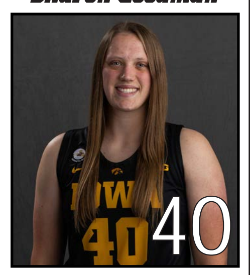
Center • 6-3 • Junior Lime Springs, Iowa Crestwood

• Made debut against Southern U after being out 2021-22 season due to injury.