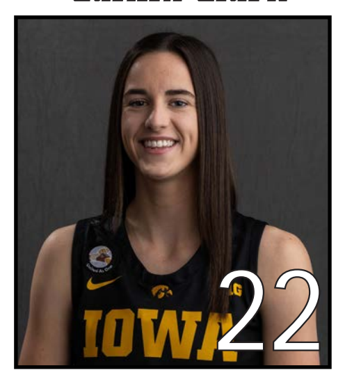
Guard • 6-0 • Junior West Des Moines, Iowa Dowling Catholic

*For full career highlights, see player page 6, 7. *