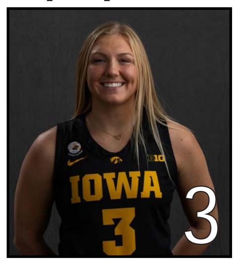
Guard • 5-11 • Sophomore Chicago, III. Marist