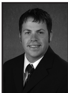
Aaron Blau Athletic Communications