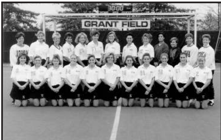
1992 / FINAL FOUR / BIG CHAMPIONS