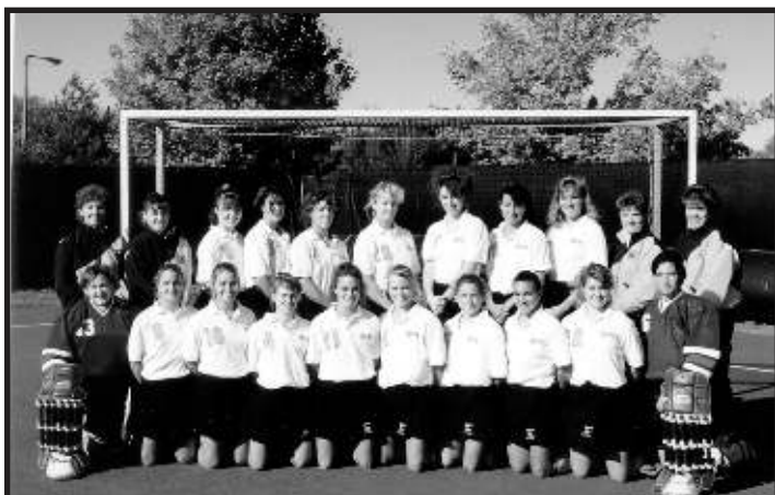
1993 / FINAL FOUR