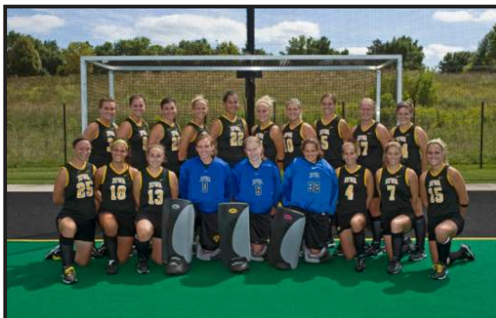
2008 / FINAL FOUR / BIG TOURNAMENT CHAMPIONS