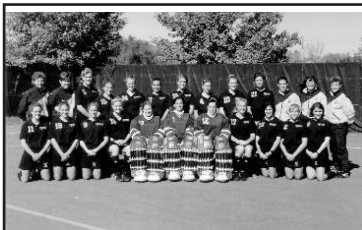
1994 / FINAL FOUR / BIG TOURNAMENT CHAMPIONS