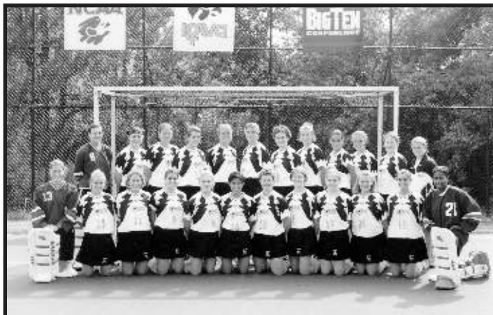
1999 / FINAL FOUR / BIG CHAMPIONS