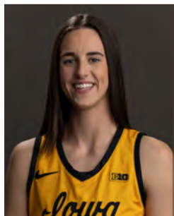
#22 Caitlin Clark Senior Guard