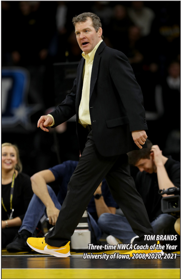
TOM BRANDS Three-time NWCA Coach of the Year University of Iowa, 2008, 2020, 2021