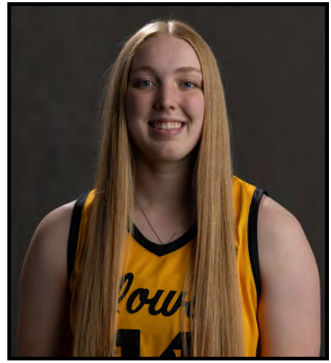
Center | 6-4 | Junior Aurora, Colo. | Grandview