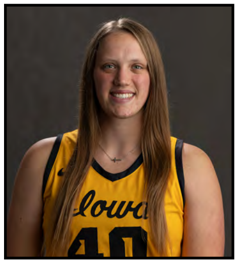
Center | 6-3 | RS-Junior Lime Springs, Iowa | Crestwood