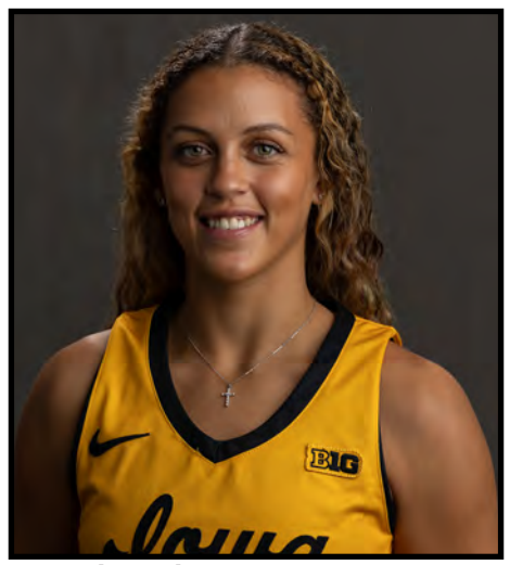
Guard | 5-10 | Fifth Cincinnati, Ohio | Mt Notre Dame In 2023-24