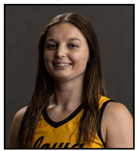
Guard | 5-9 | Sophomore Fremont, NE. | Fremont