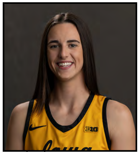
Guard | 6-0 | Senior West Des Moines, Iowa | Dowling