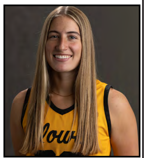
Guard | 6-0 | Grad. Edwardsville, Ill. | Edwardsville