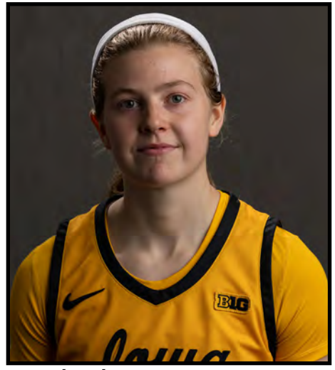
Guard | 5-7 | Fifth Midland, Mich. | Central Michigan