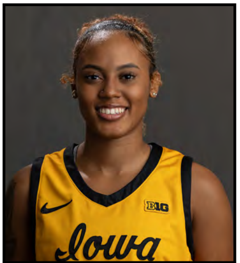
Guard | 5-4 | Freshman Joliet, Ill. | Example Academy