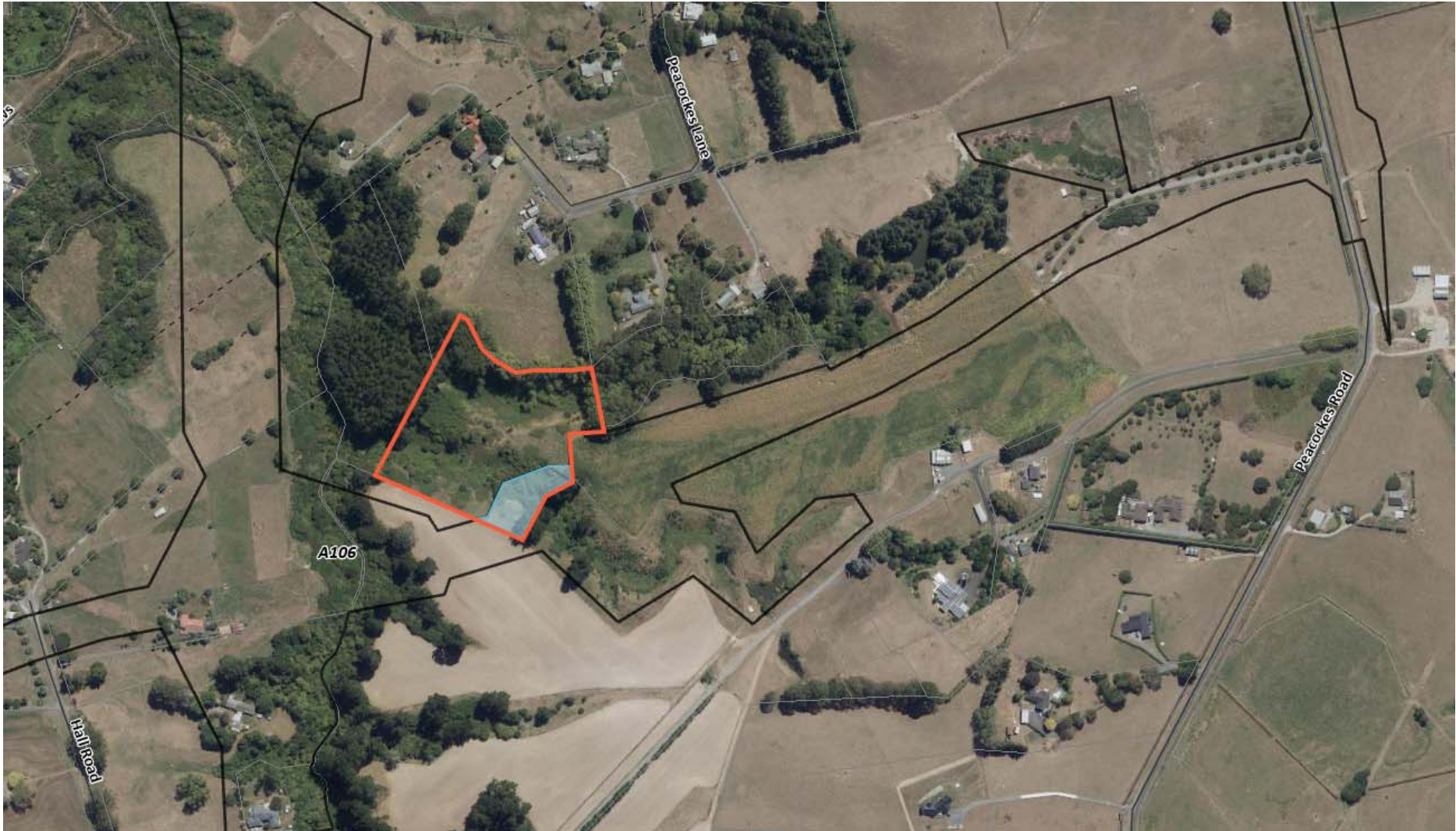
Red outline – indicates Whatukoruru Reserve Blue Hatched area – indicates area of reserve to be road Black line – indicates Roding Designation