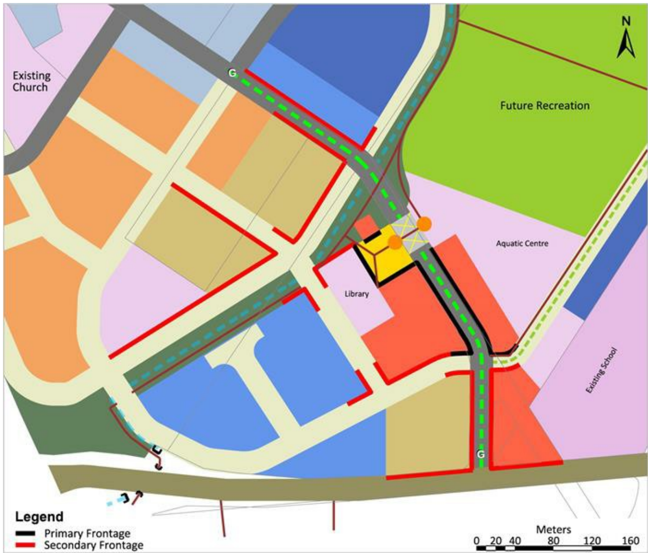
Figure 7-4: Residential Mixed-Use – Location of Retail Frontages