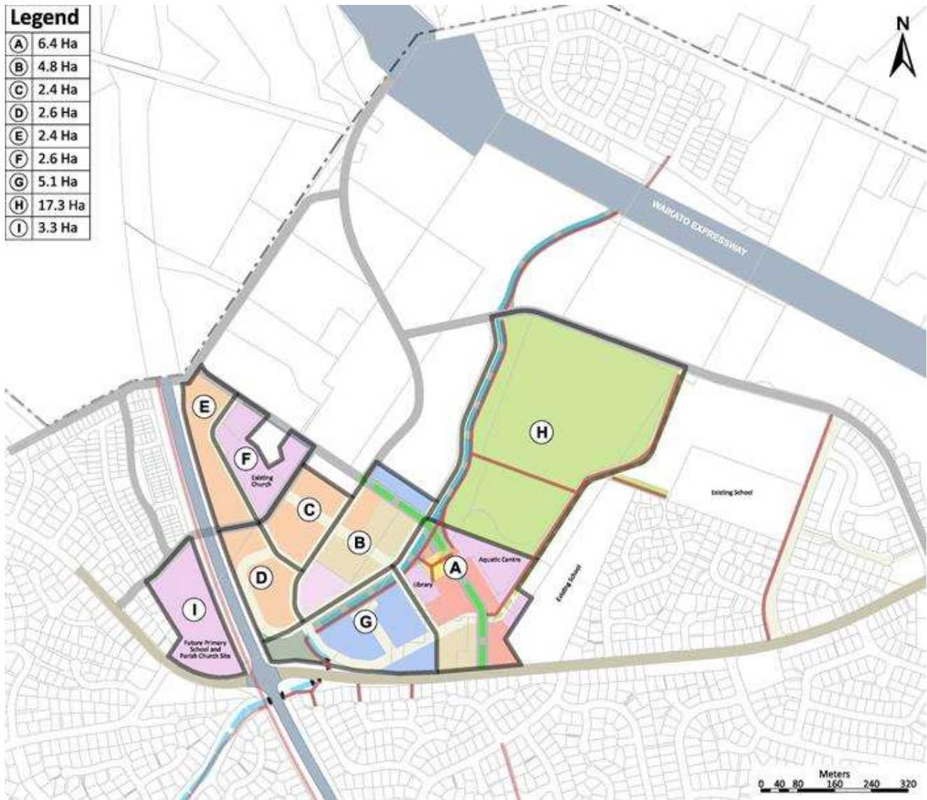
Figure 7-2: Comprehensive Development Plan Development Areas – Rototuna Town Centre