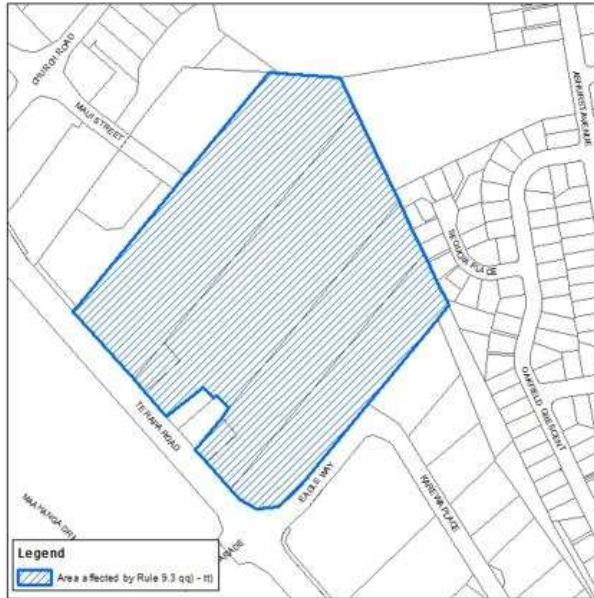
2 DPS 4044 Area affected by Rule 9.3.qq. to tt.