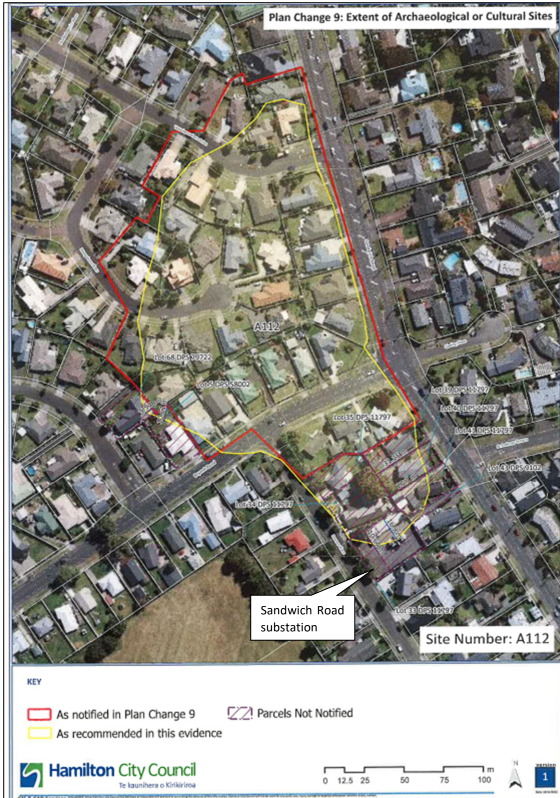
Figure 2: Location of Sandwich Road substation within A112.