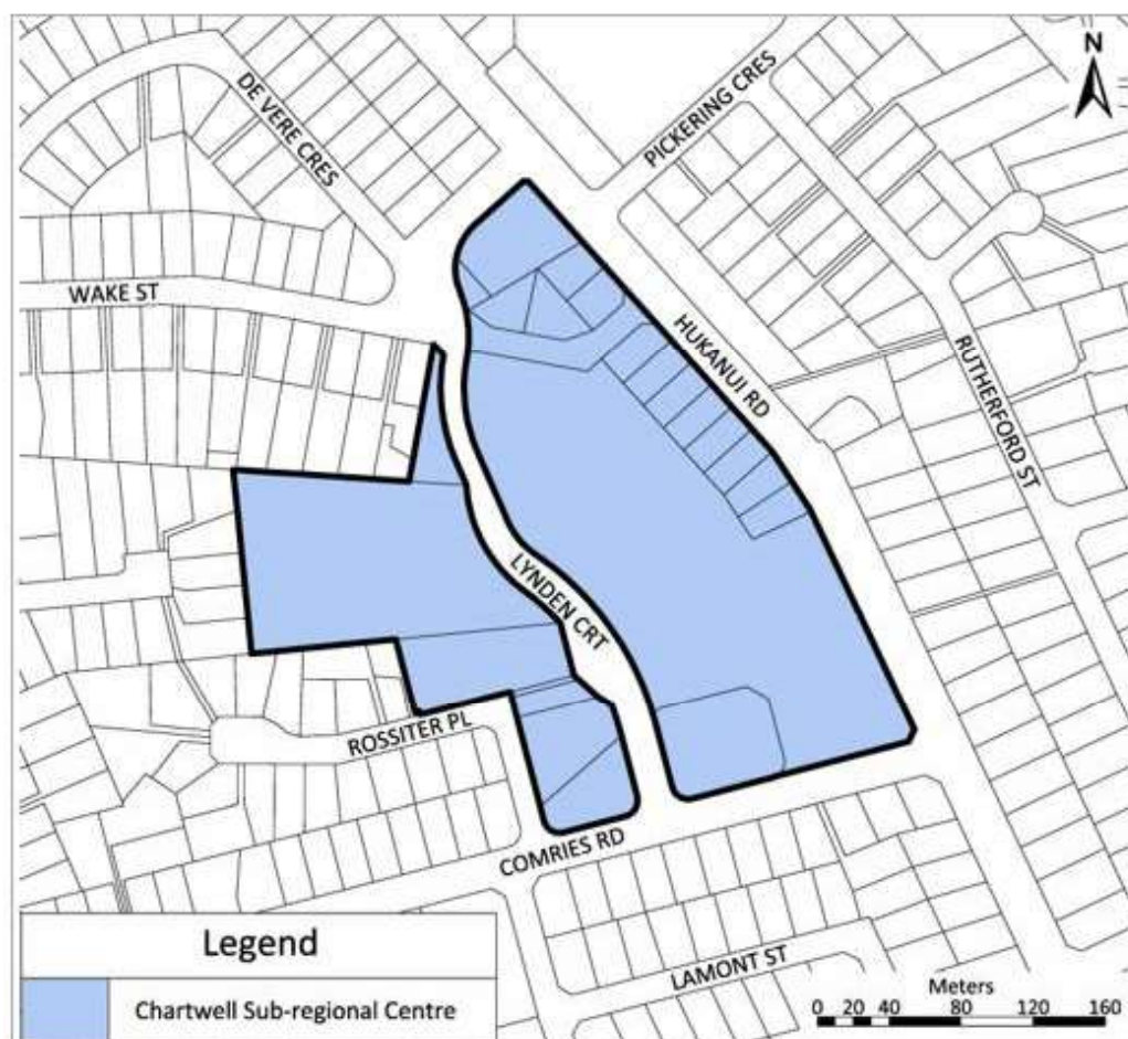
Figure 6.1b: The Base Sub-regional Centre