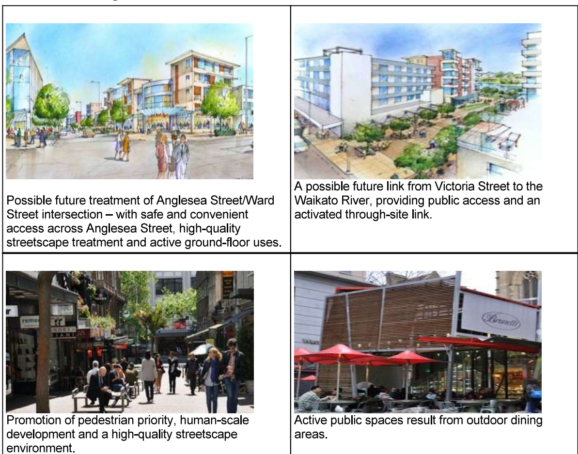
Figure 7.1.1f: Illustrative outcomes for Precinct 1 – Downtown Precinct