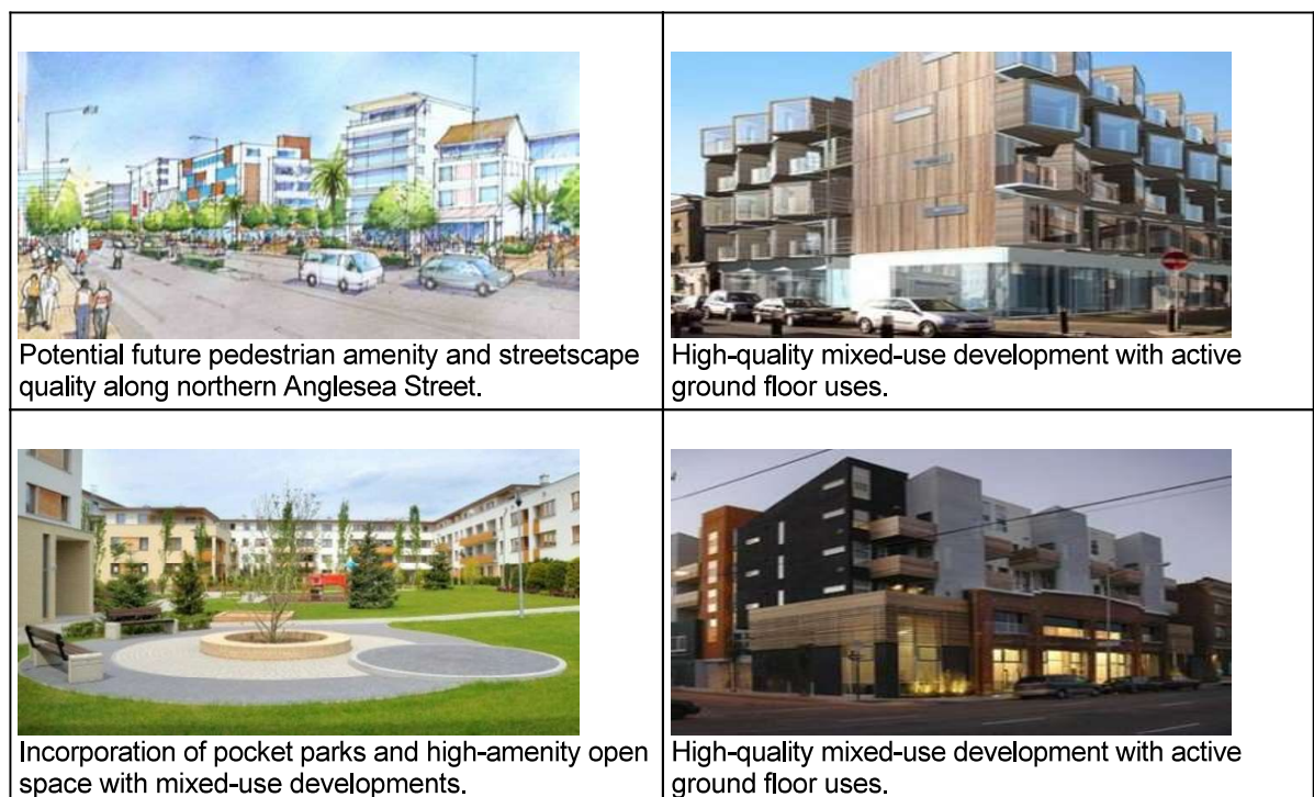
Figure 7.1.2e: Illustrative outcomes for Precinct 2 – City Living Precinct