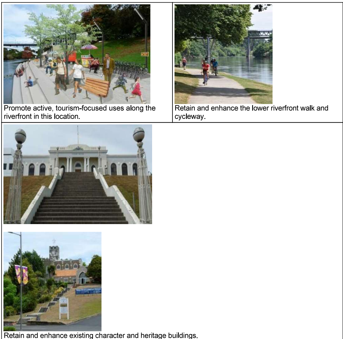
Figure 7.1.3e: Illustrative outcomes for Precinct 3 – Ferrybank Precinct