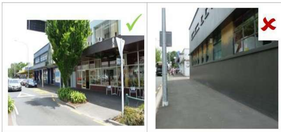
Figure 7.4.13b: Existing façades showing active façades and veranda cover that are promoted (left) and blank façades that are discouraged (right)