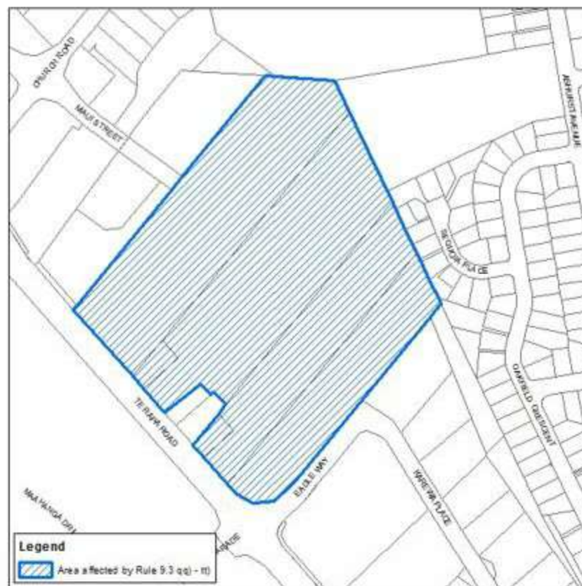
Figure 9.3a: Lot 3 DP S270, Pt Lot 3 DRO 346, Pt Lot 2 DRO 346, Pt Lot 1 DPS 4044 and Pt Lot 2 DPS 4044 Area affected by Rule 9.3.qq. to tt.