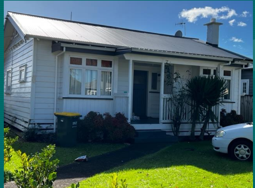
69 Albert St