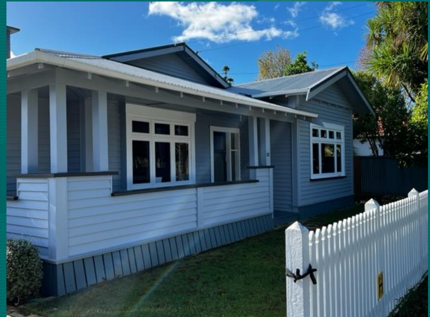
127 Albert St