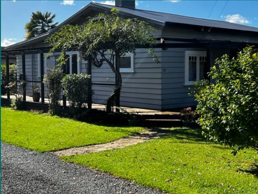
109 Albert St