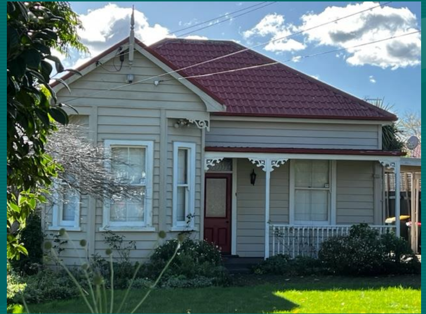
115 Albert St