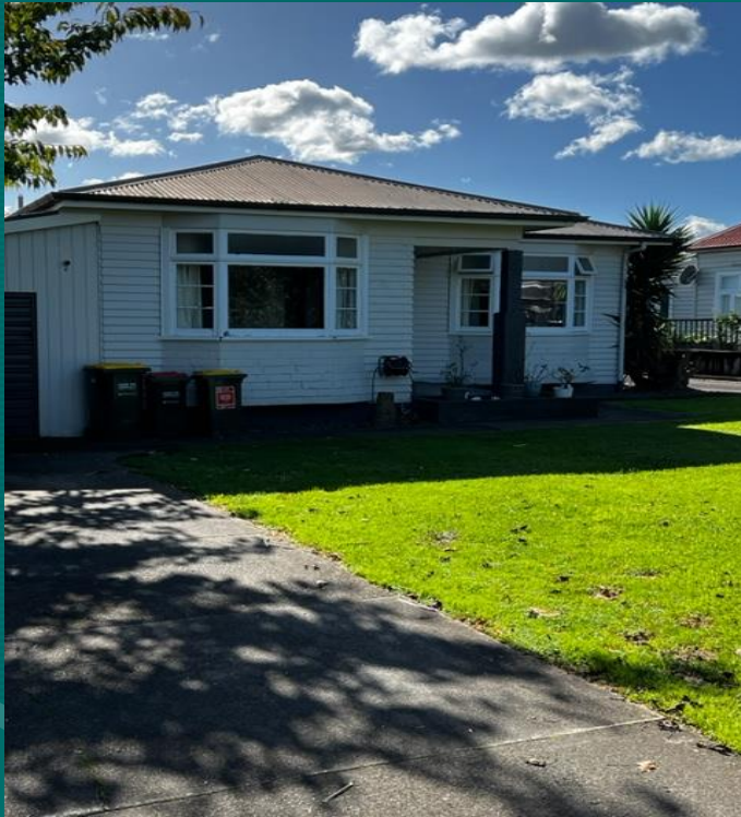
126 Albert St