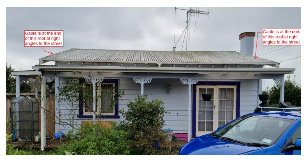
House in Oxford (East) HHA