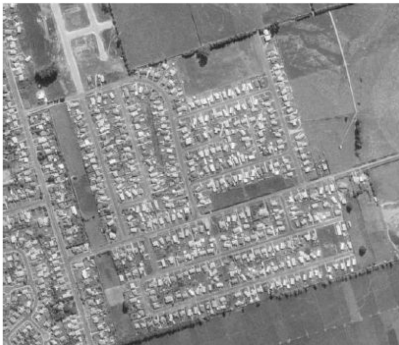
1974 subdivisional aerial (Retrolens 1974) for base on evidence