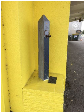
The hitching post set into a corner niche of the general store. 17 September 2023.