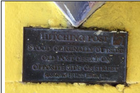
Plaque on plinth.