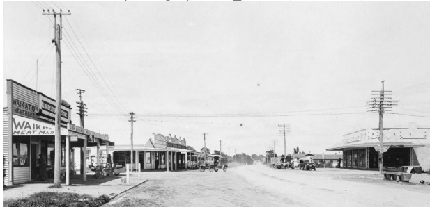
Claudelands Shopping Centre c.1920s. HCL_10448

This post was recorded as being outside Gadd's store or further along the footpath nearby, but moved in the early 1950s to the current location outside what has been a busy street corner since the development of Claudelands in the early 20 th century. The Kirikiriroa railway station was nearby. Two hitching posts can be seen in front of the store close to the road in the 1920s photograph HCL_10448 (see below).