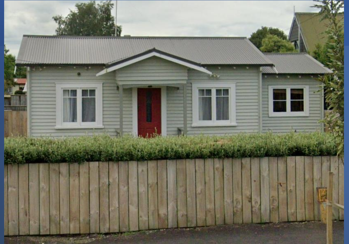
33 Oxford Street