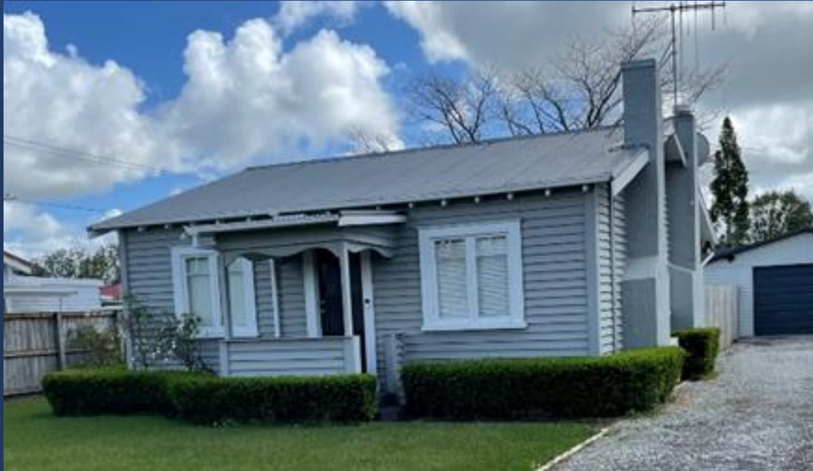
25 Oxford Street