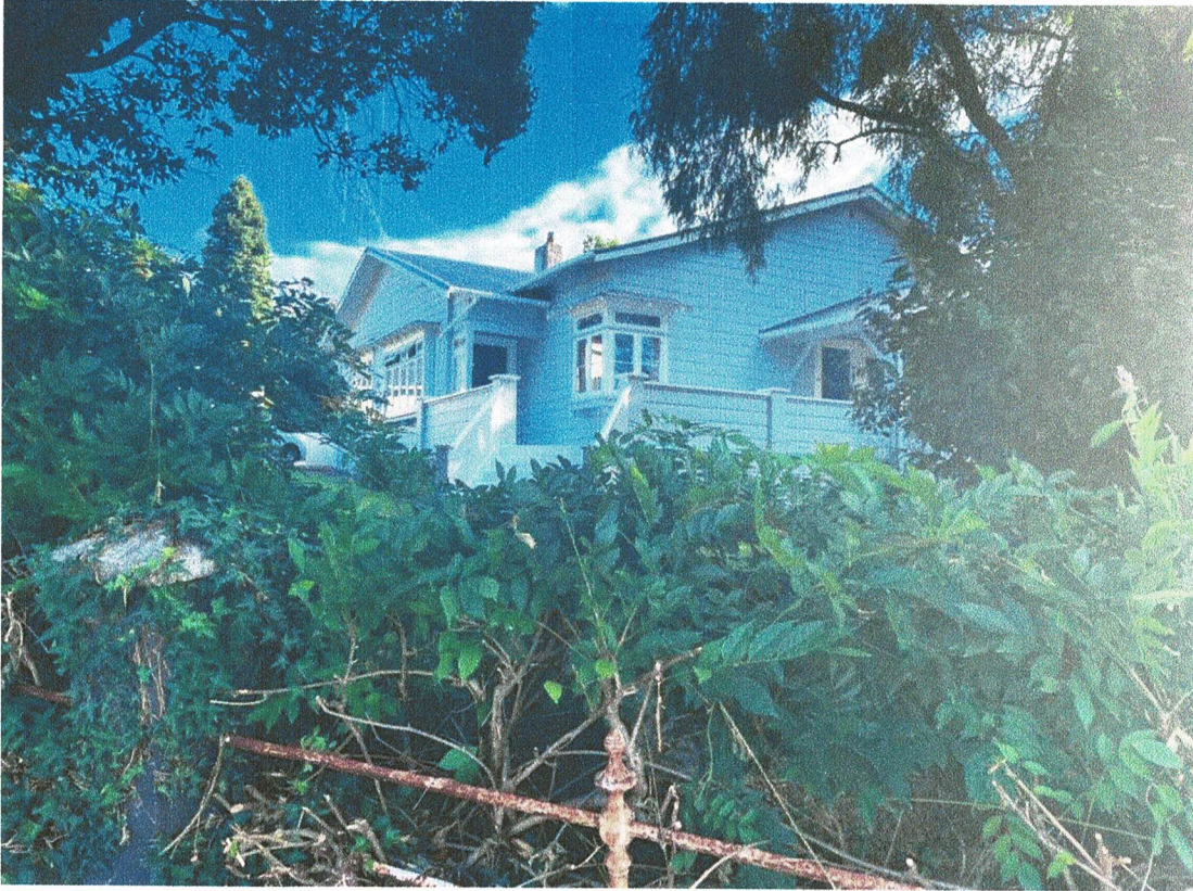
92 Lake Road ("1 Queens Ave")