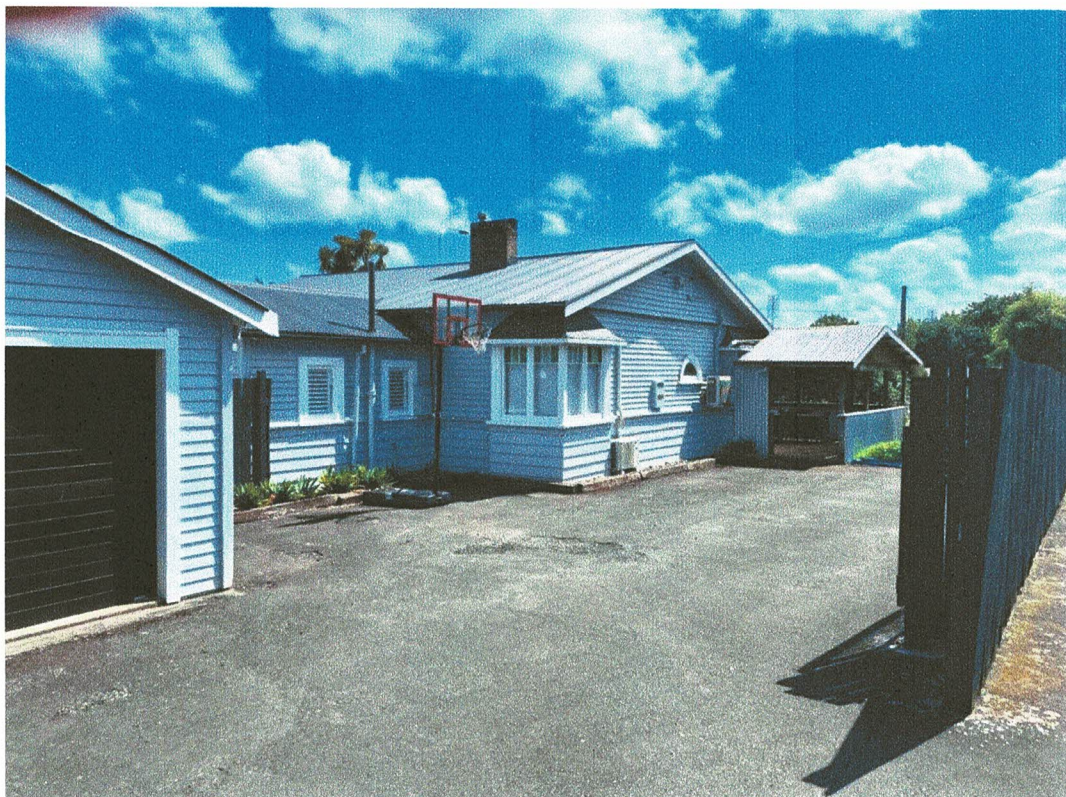
94 Lake Road ("2 Queens Ave")