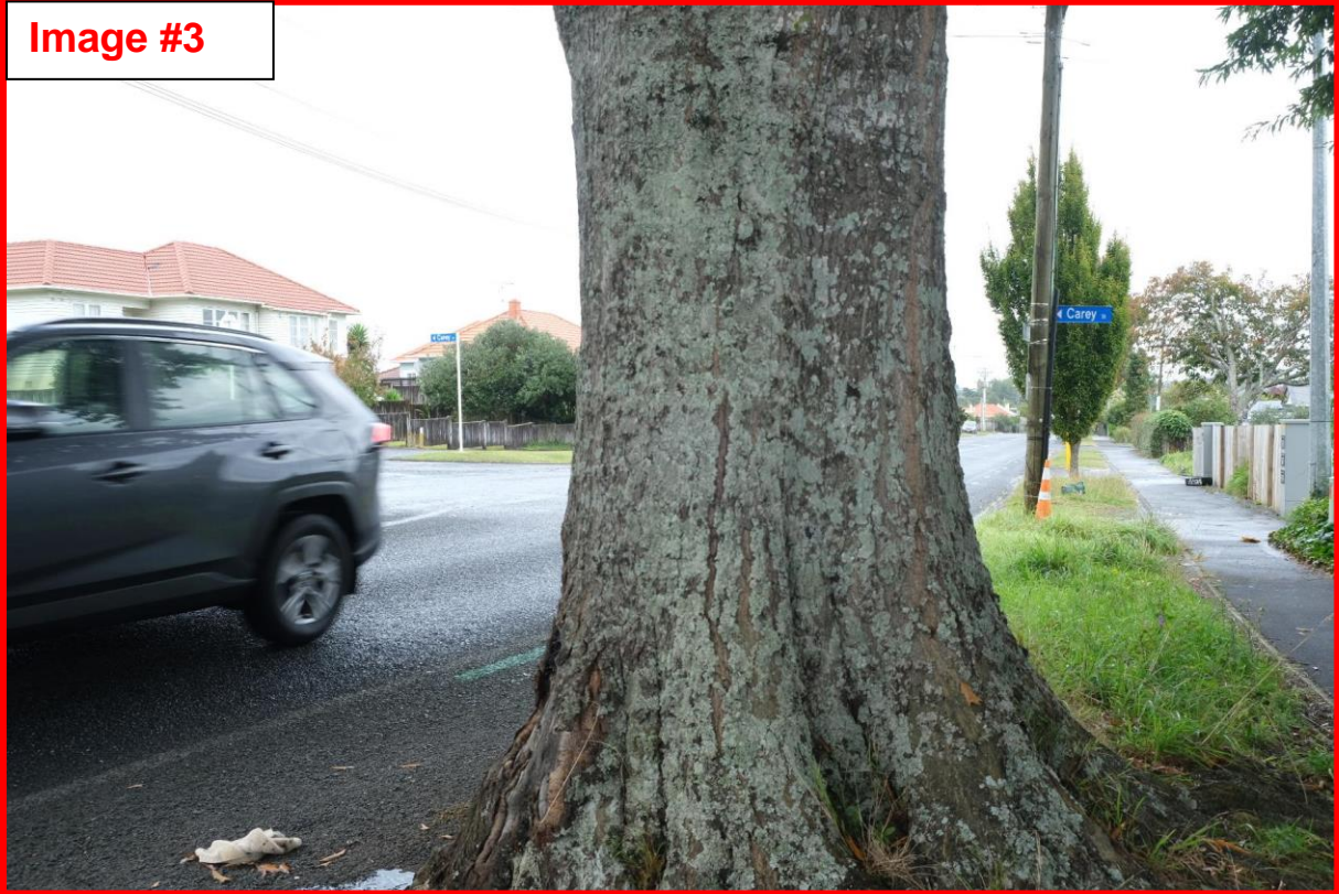
[Sequence - 2]