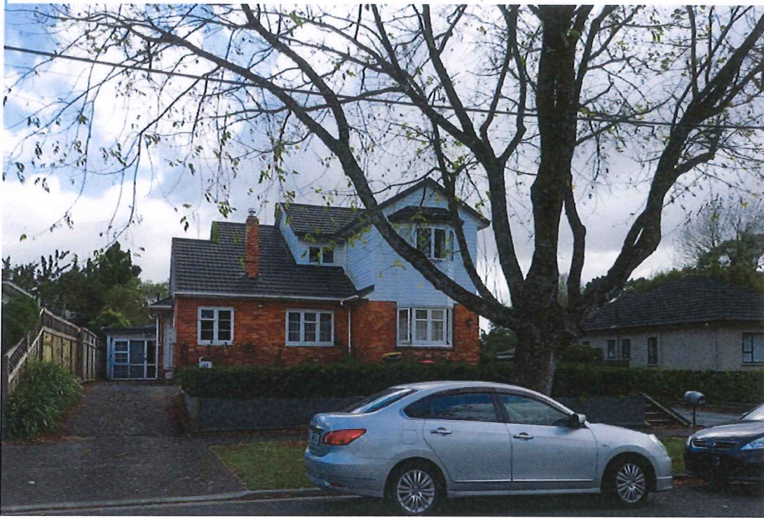
17 and 13 Marire Ave. A poor representation of 1920s/30s era housing typologies and and State housing