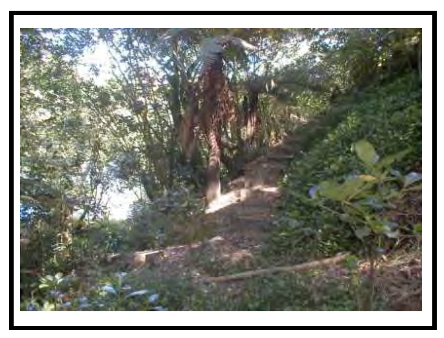
Existing walkway to Waikato River edge

Pedestrian access within the reserve will be designed and constructed so as to minimise disturbance to the site, whilst providing the best possible viewing of the site features. The existing walkway to the river's edge will be reinstated to meet safety requirements, including railing.