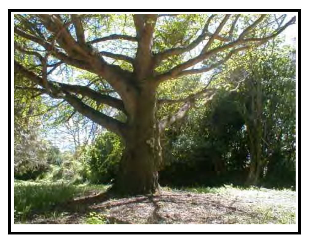
Identified Significant Tree on Miropiko Reserve

The Significant Trees overlay seeks to protect individual trees and groups of trees and promote the maintenance of their values. Eight (8) large established trees on the reserve site are identified as Significant Trees. The removal of or modification to Significant Trees requires a discretionary activity resource consent. These provisions in the notified Proposed District Plan may change through the public submission process on the plan.