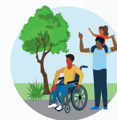
Inclusivity for all