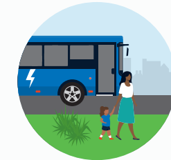
Limited travel choices