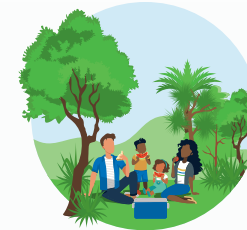
Parks and green spaces