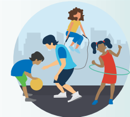
Young population that embraces change