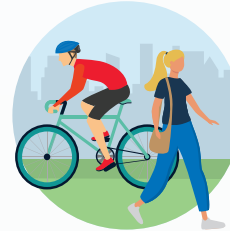
An easy walking and biking city