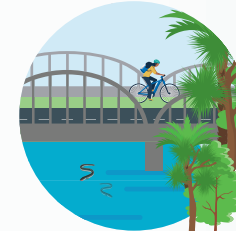
Te awa o Waikato (the Waikato River)