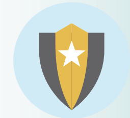
Safety and perception of safety