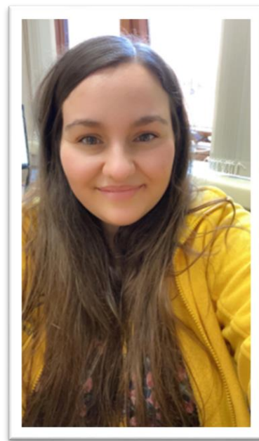
Lincoln County Hospital