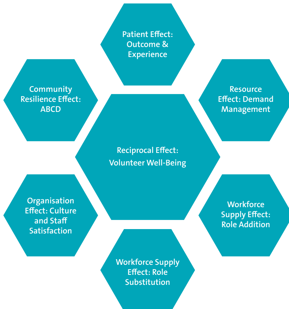
Figure 2. Seven Domains of Volunteer Effectiveness

We define effectiveness using a framework containing seven elements (Figure 2).