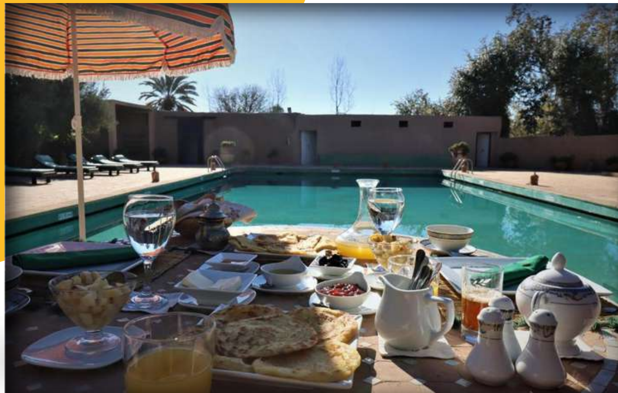
DAILY MOROCCAN BREAKFAST ( Traditional food )