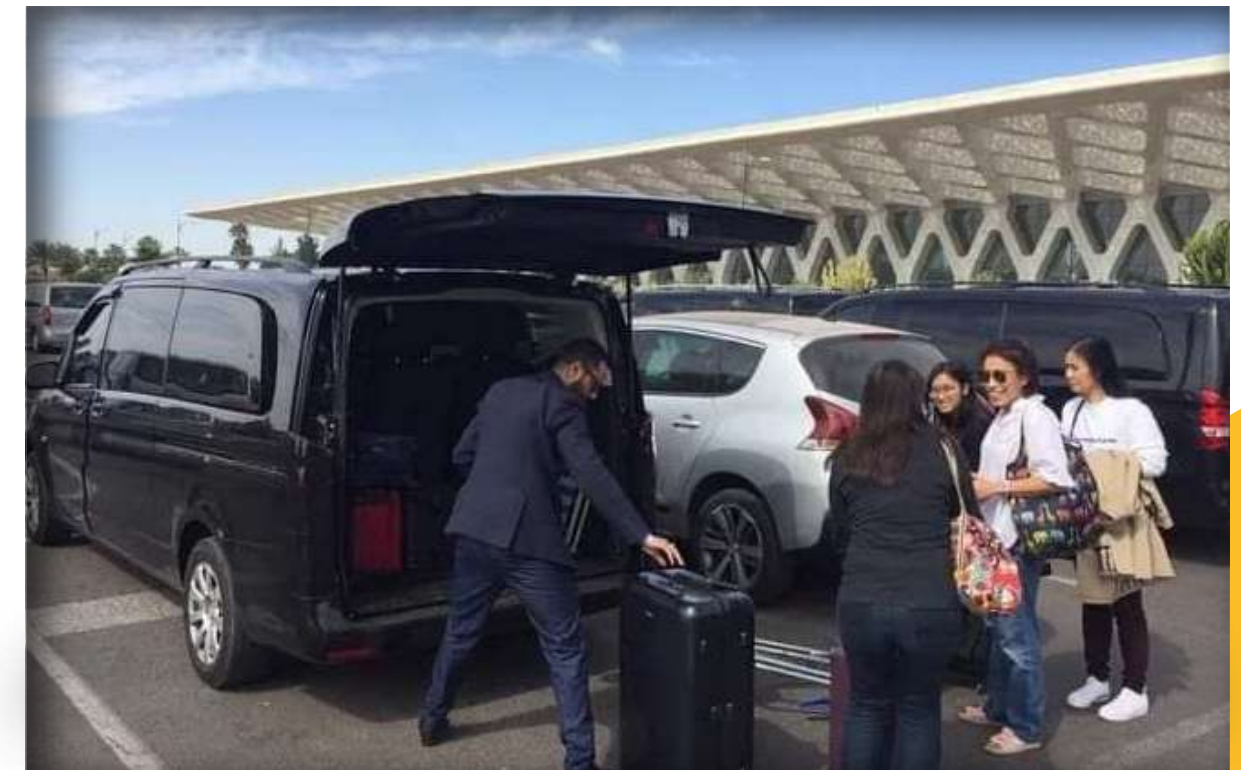
TRANSFER TO AND FROM AIRPORT ( Marrakech Ménara )