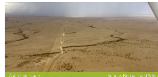
A dry landscape

This is not doom and gloom. This is smart risk management. If a late wet season arrives, then the country will have a chance to recover. Also, cattle that have been sold down early have become money in the bank.