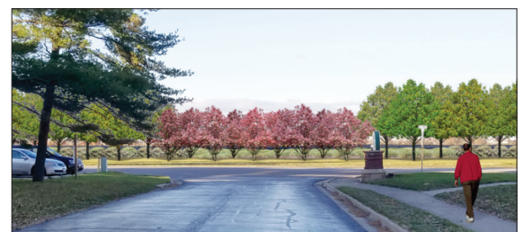
A landscape buffer was installed between Solar Farm 2.0 and Village of Savoy homes and businesses.