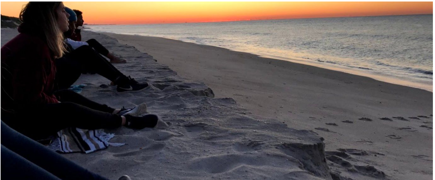
Students from an Ecotheology Honor Seminar (Wingate University) Mediation at dawn at the Rachel Carson Reserve, Outer Banks NC ... watching a schools of dolphins in the distance

CCCCU Environmental Stewardship Statement