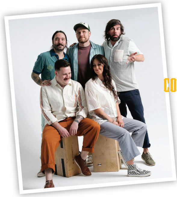
SUNDAY NIGHT CONCERT FEATURING: REND COLLECTIVE