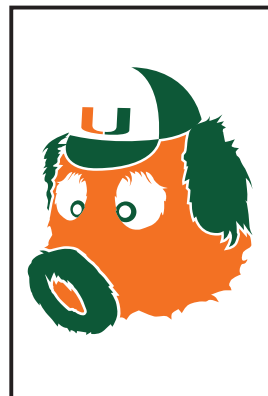
Game 3: TBA