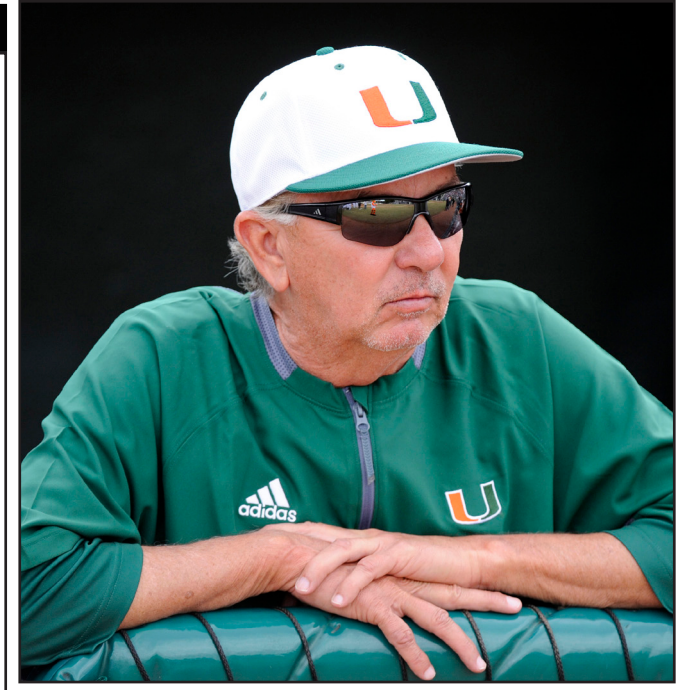
possession of eighth place in all-time wins (1,439) on Feb. 15 with a 25-4 win over Rutgers and then seventh place with a 9-5 win over Louisville on March 7 (1,445).