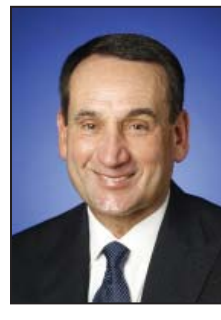
Mike Krzyzewski Head Coach 32nd Season at Duke