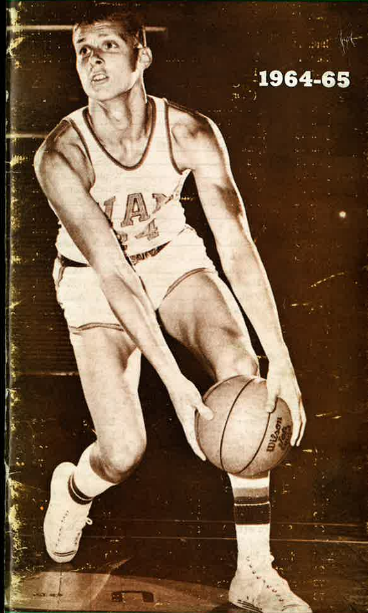
RICK BARRY ALL-AMERICA CANDIDATE