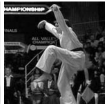
10 most unrealistic sports movie scenes

Please note by clicking on "add a comment" you acknowledge that you have read the Terms of Use and the comment you are posting is in compliance with such terms. Be polite. Inappropriate posts may be removed by the moderator.